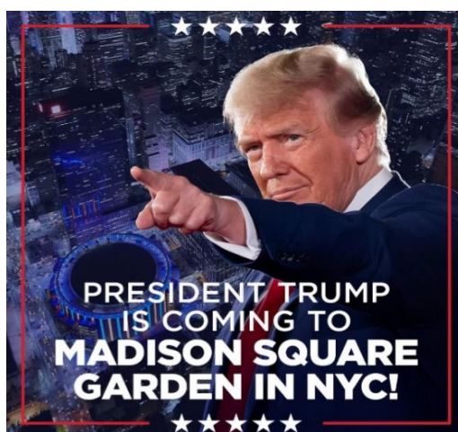
Figure 1. Posted by Donald Trump on 15 October 2024

The following are some images that illustrate key moments and statements from Donald Trump's Instagram posts. Each image serves to reinforce the thematic elements discussed in the analysis, providing a visual context that enhances understanding of the themes and schemas identified.