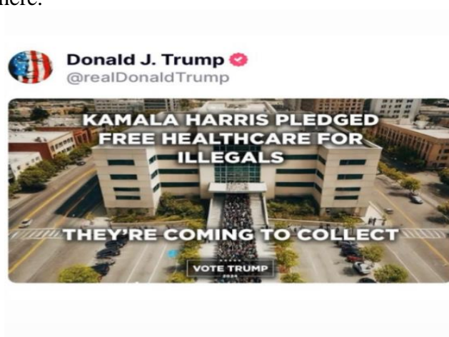
Figure 2. The post shown to Kamala Harris on 12 October 2024

This post was posted on Donald Trump's Instagram reel to inform his fans that he was coming somewhere.